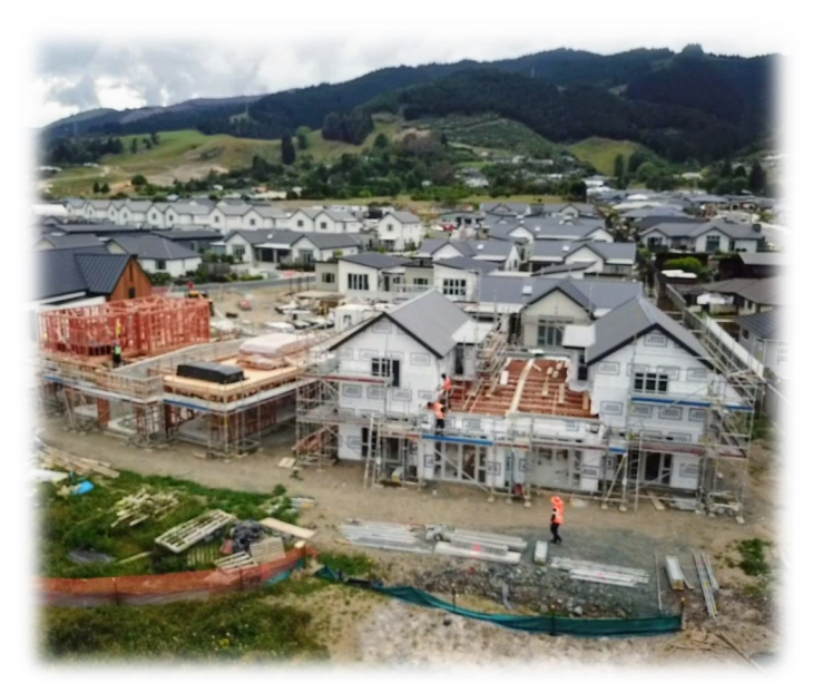
Stage 4B Terrace Houses and Villas