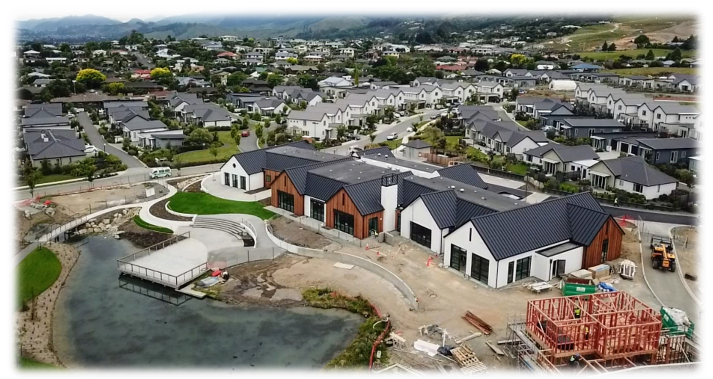
Aerial of The Lakehouse